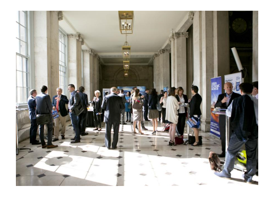
Photo 10: Infrastructure Summit mingle at a Reception in Dublin City Hall